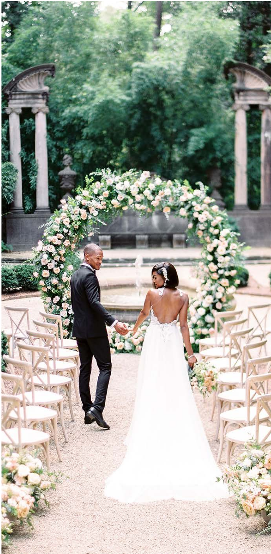
This Page Cover: Renee Jael Top: Elizabeth Austin Photography