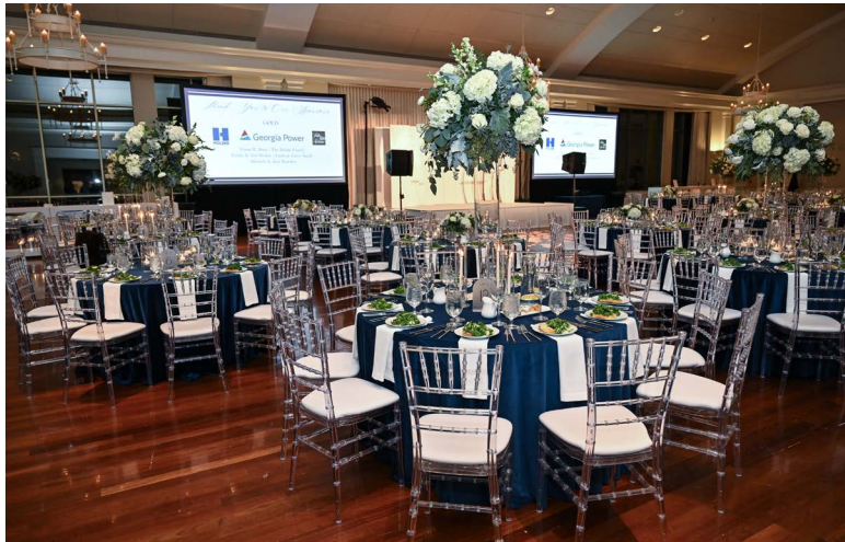
Opposite Page Top: Unknown