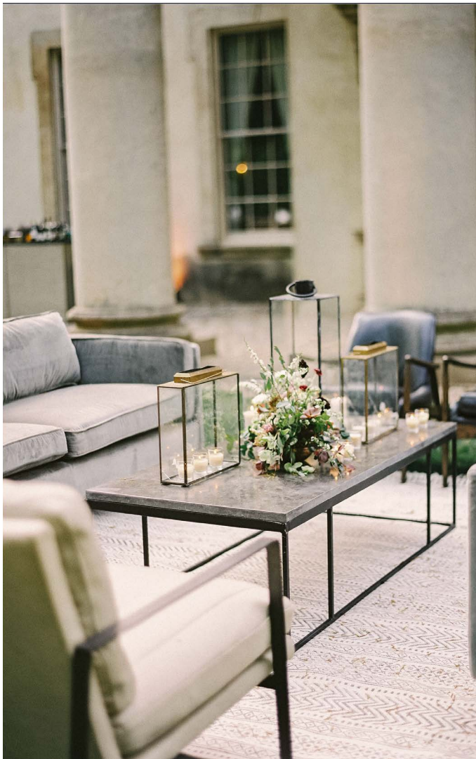
Opposite Page Unknown