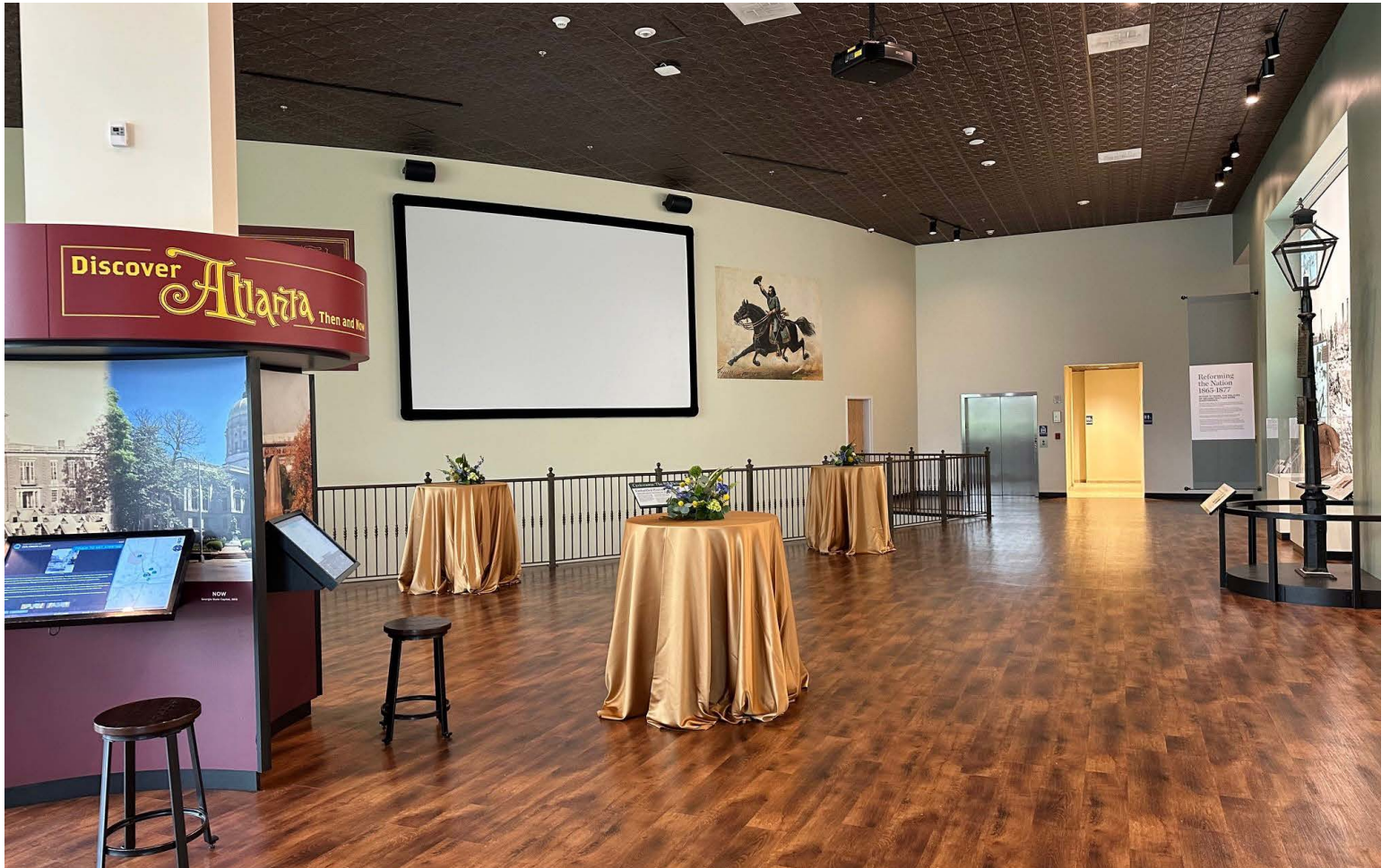
Opposite Page Top: Unknown