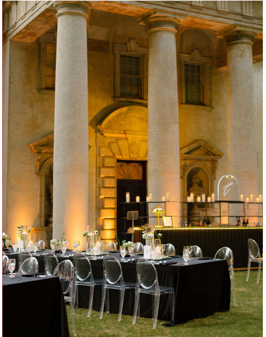
This Page Bottom Right: Unknown Bottom Left: Unknown