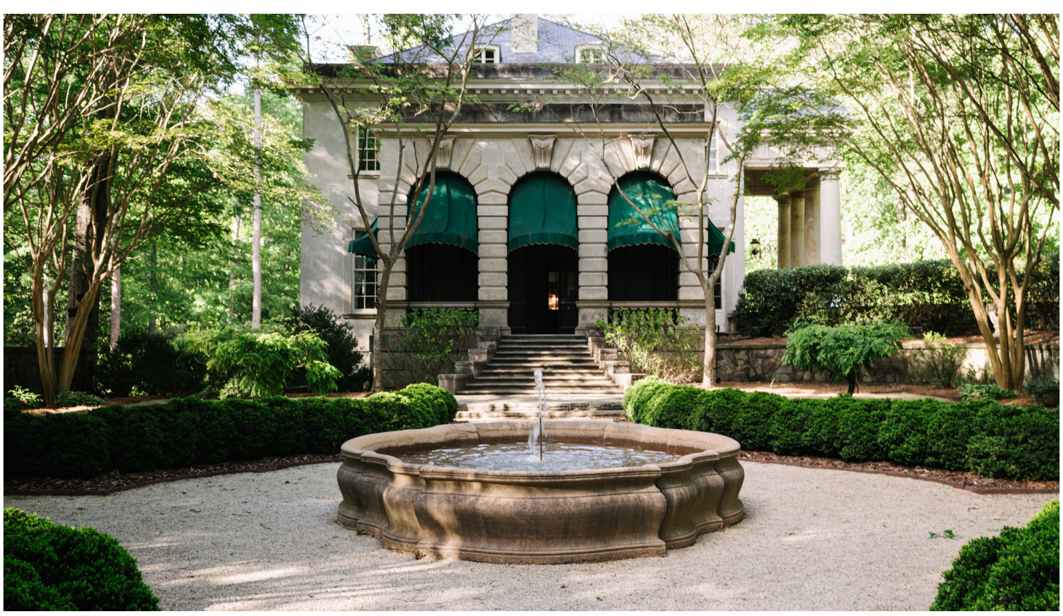
This Page Top Left: Anna Shackleford Photography Top Right: Glorianna Chan