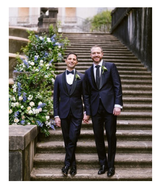
Opposite Page Top: Archetype Studio Inc. Cover: Megan Wallach