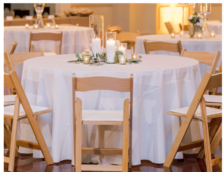
This Page Top Left: Jessica Gold Photography Top Right: Derek Wintermute