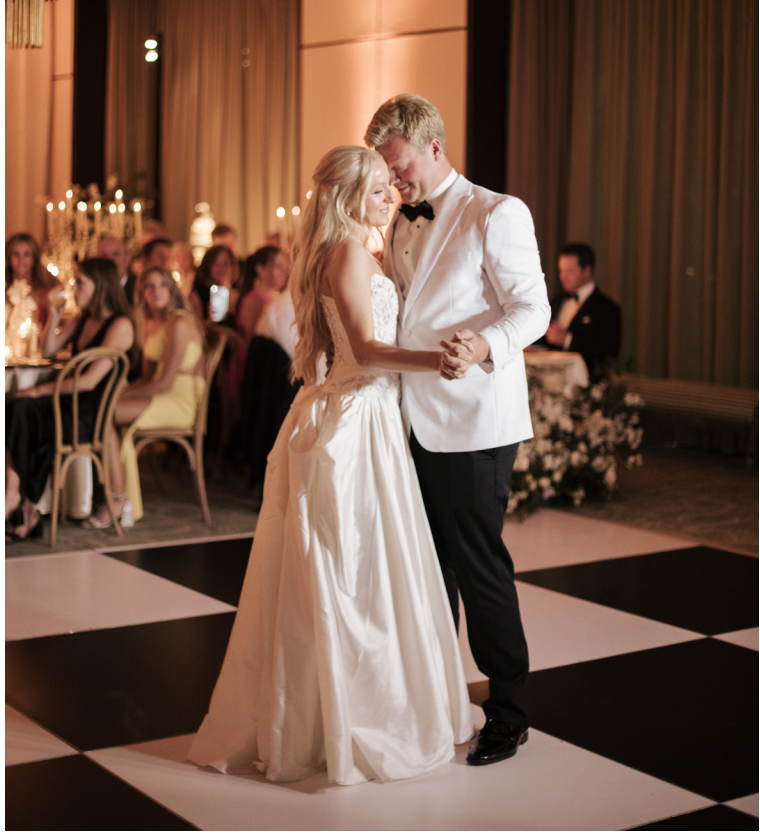
<u>This Page</u> Top: Savannah Sturkie Bottom (both): Dyess Photo