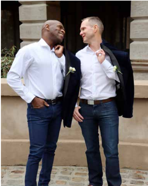
Opposite Page Top: Archetype Studio Inc. Cover: Megan Wallach