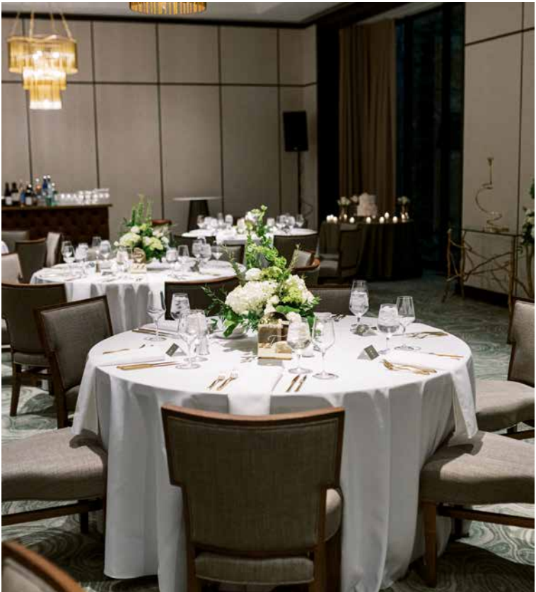
Opposite Page