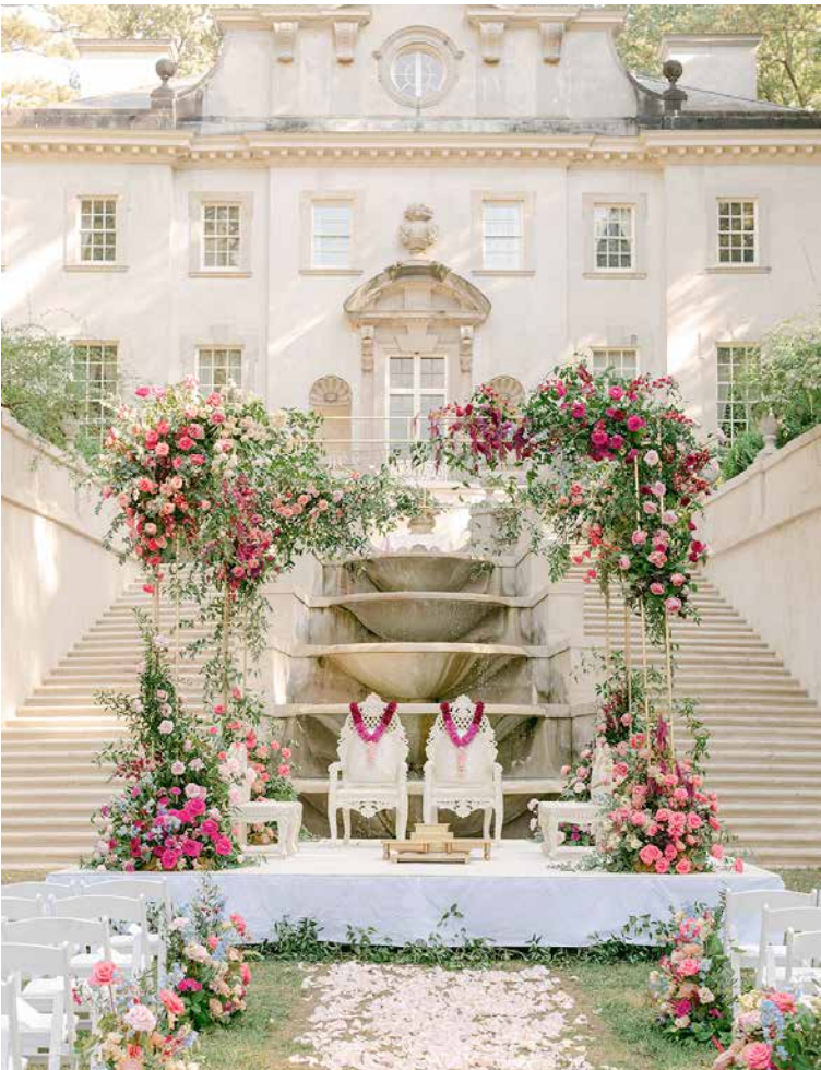
Opposite Page Eve Yarbrough