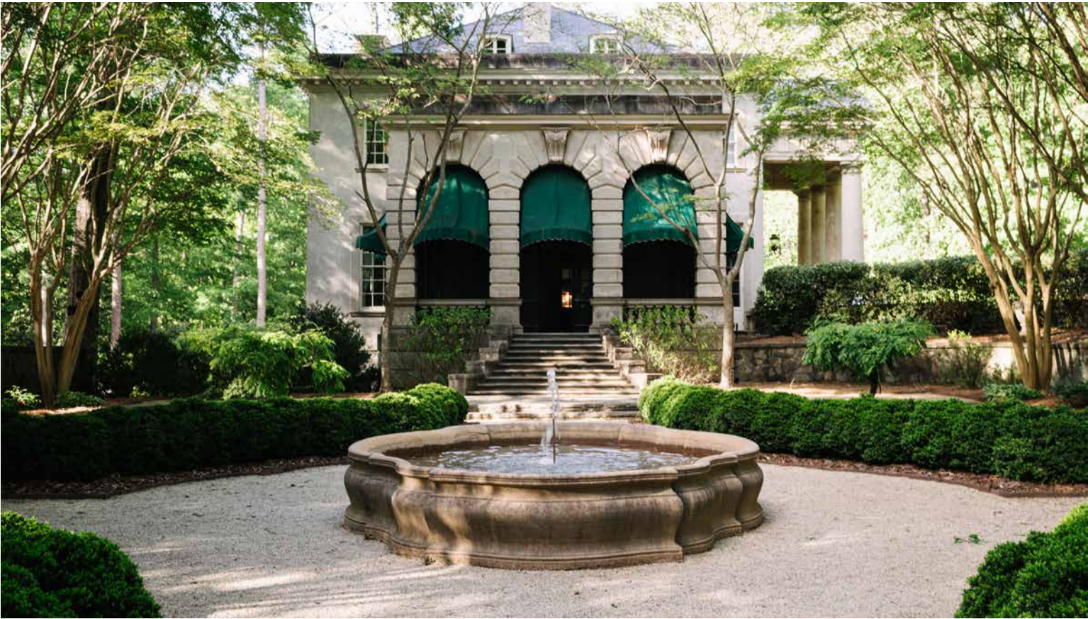
This Page Top Left: Anna Shackleford Photography Top Right: Glorianna Chan