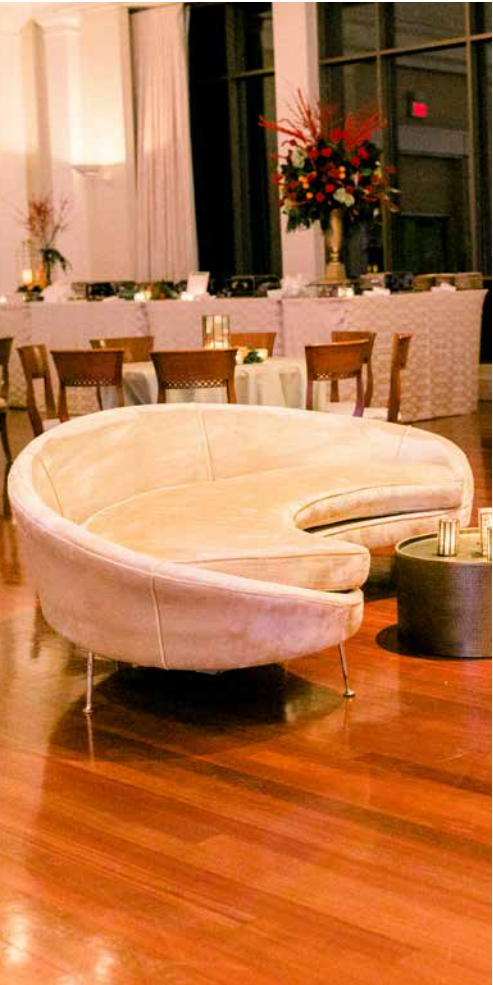
Opposite Page Top: Unknown