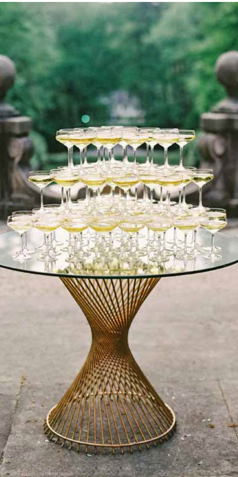
Opposite Page Unknown