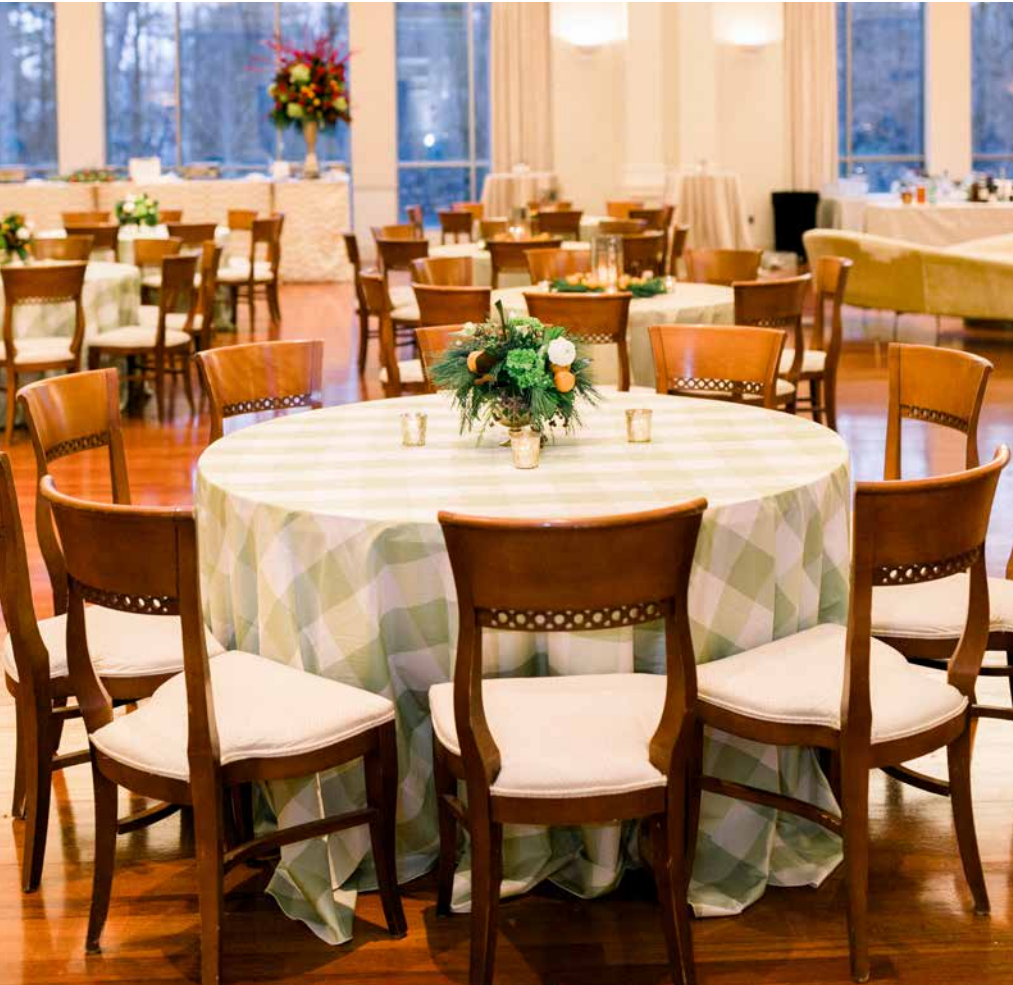
This Page Top Right: IIDA Fashion Show Bottom Right: Sarah-Brooke-Photography Bottom Left: Sarah-Brooke-Photography