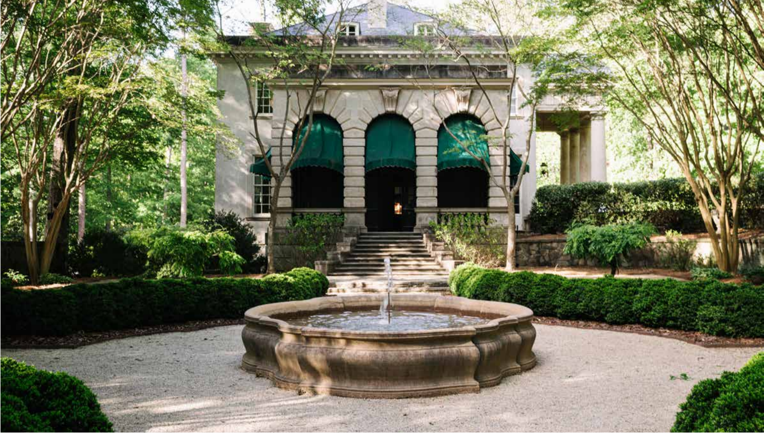
This Page Top Left: Anna Shackleford Photography Top Right: Glorianna Chan