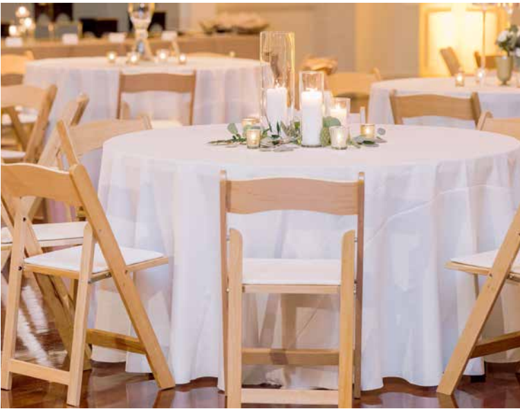
Opposite Page Picture This! Photography