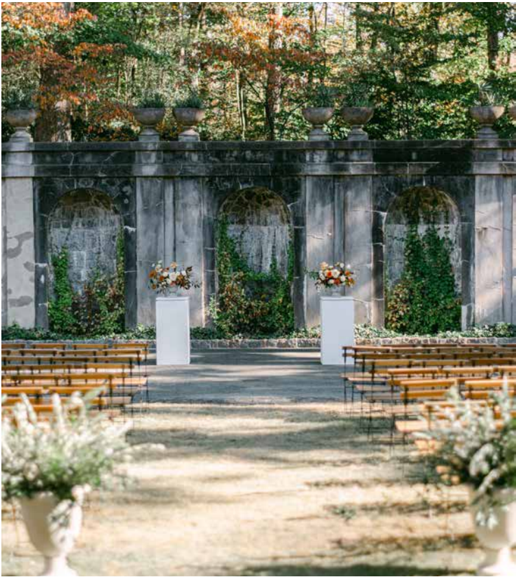
This Page Top: Anna Shackleford Photography