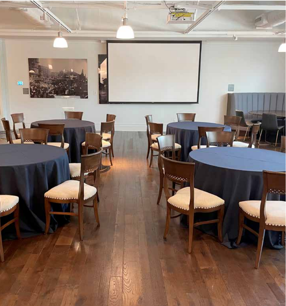
This Page Top Right: Unknown Bottom Right: Unknown Bottom Left: Unknown