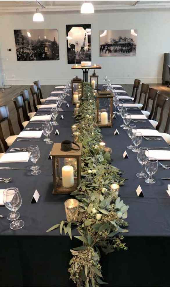
Opposite Page Top: Unknown