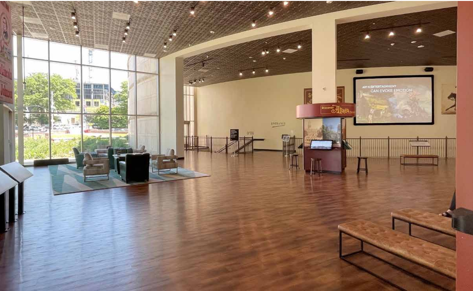
Opposite Page Top: Unknown