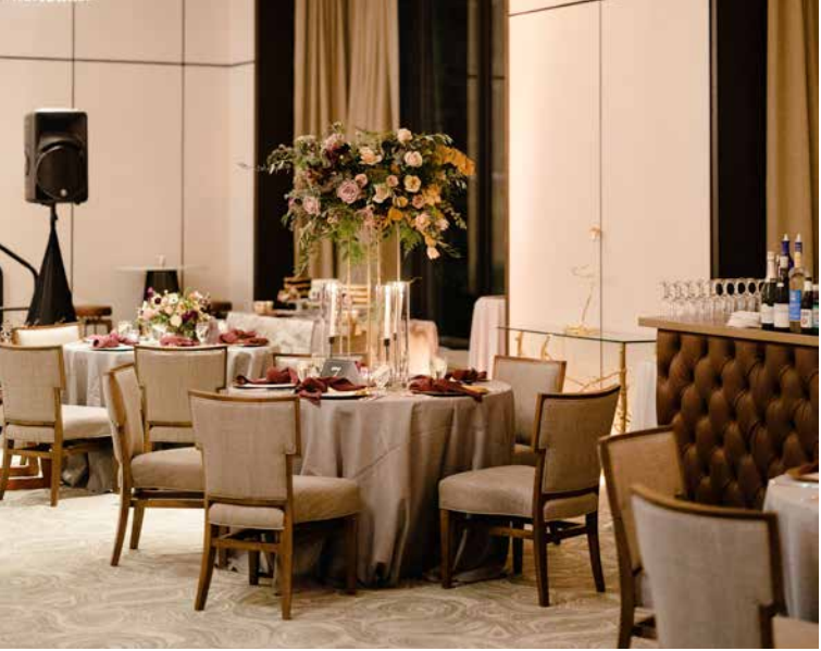
Opposite Page Steven Dickson