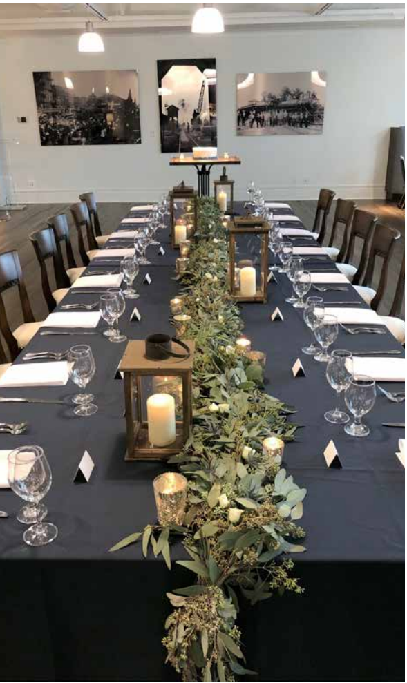
Opposite Page Top: Unknown