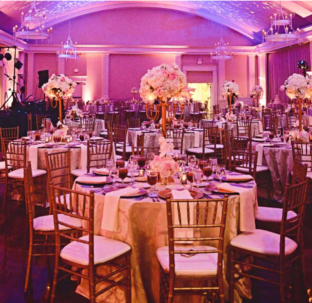
Opposite Page Top: PWP Studio