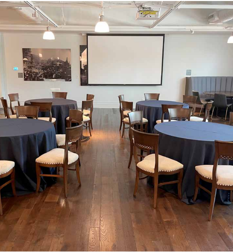
This Page Top Right: Unknown Bottom Right: Unknown Bottom Left: Unknown