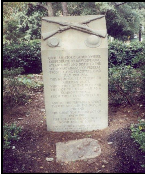
Location: Peachtree Battle Avenue, near Peachtree Road Intersection Erection/dedication date: 1935

The monument at Peachtree Battle Avenue was erected by the Old Guard of Gate City Guard. It was dedicated by Atlanta Post No. 1, American Legion, in 1935. The monument features text that describes it as a “tribute to American Valor” and focuses on a reconciliation narrative. The Spanish-American War and World War I are both described as moments of reunion between North and South to fight a common enemy. Similar to the Peace Monument, the reconciliation narrative of this monument must be interpreted in the context of the Jim Crow era.