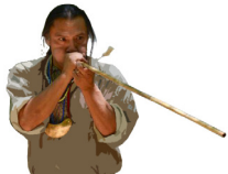
Hunting small animals with a blow gun or large animals with a bow and arrow