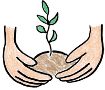
Planting and Harvesting Food