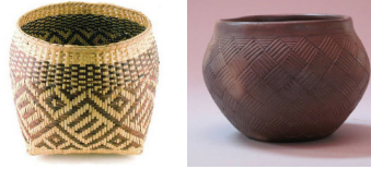
Making baskets and pottery to carry water and food