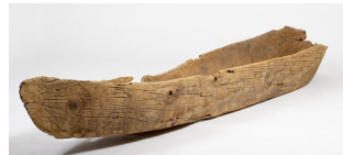
Making canoes out of tree trunks to travel down river