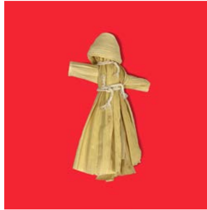
Corn Husk Doll Corn Husk and Yarn (Amelia Pousner)