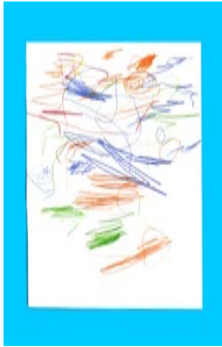
Gatheround Family Portrait Crayon on Paper (Anonymous)