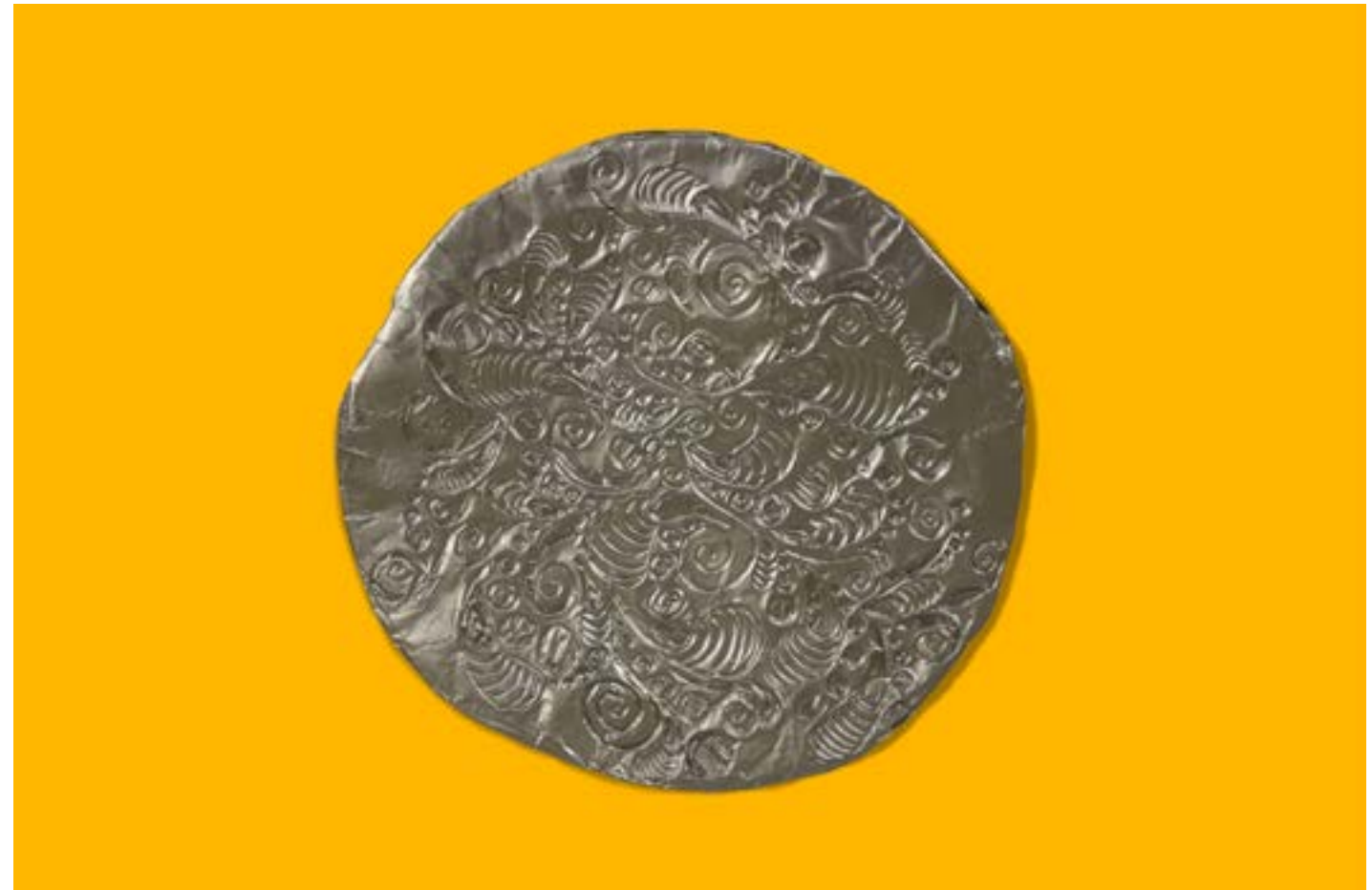
Untitled Carved Tin Foil (Amelia Pousner)