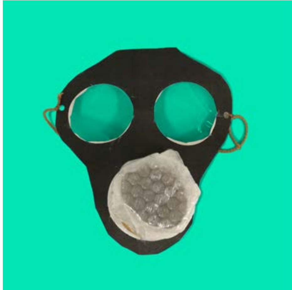
WWI Gas Mask Paper, Yarn, Bubble Wrap, and Found Objects (Sophie Underwood)